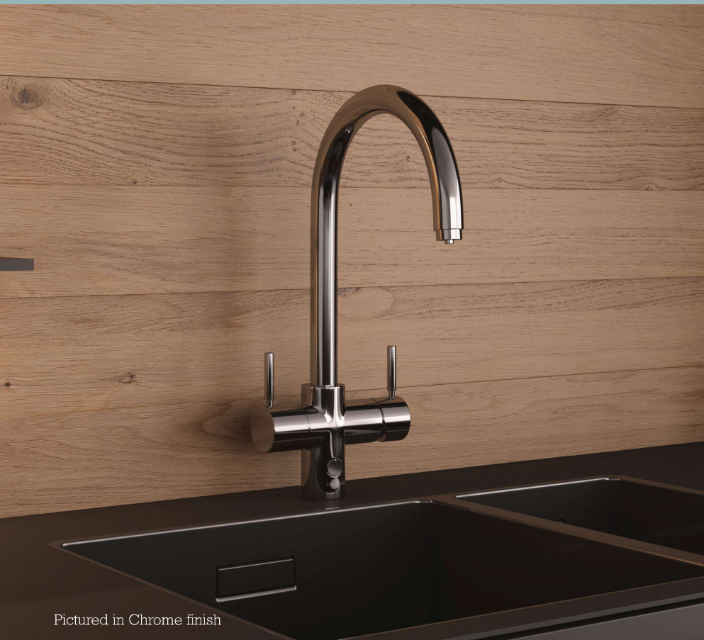
Pictured in Chrome finish