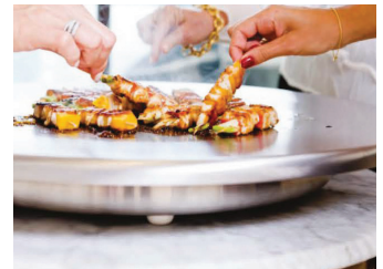
Manufacturer reserves the right to change, alter, update or discontinue any model without notice. Shown accessories not included.