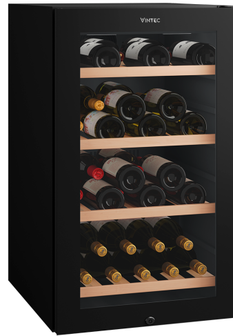
Underbench Wine Cabinets VWS830FCB, VWS830FAS