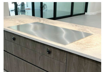
Manufacturer reserves the right to change, alter, update or discontinue any model without notice. Shown accessories not included.